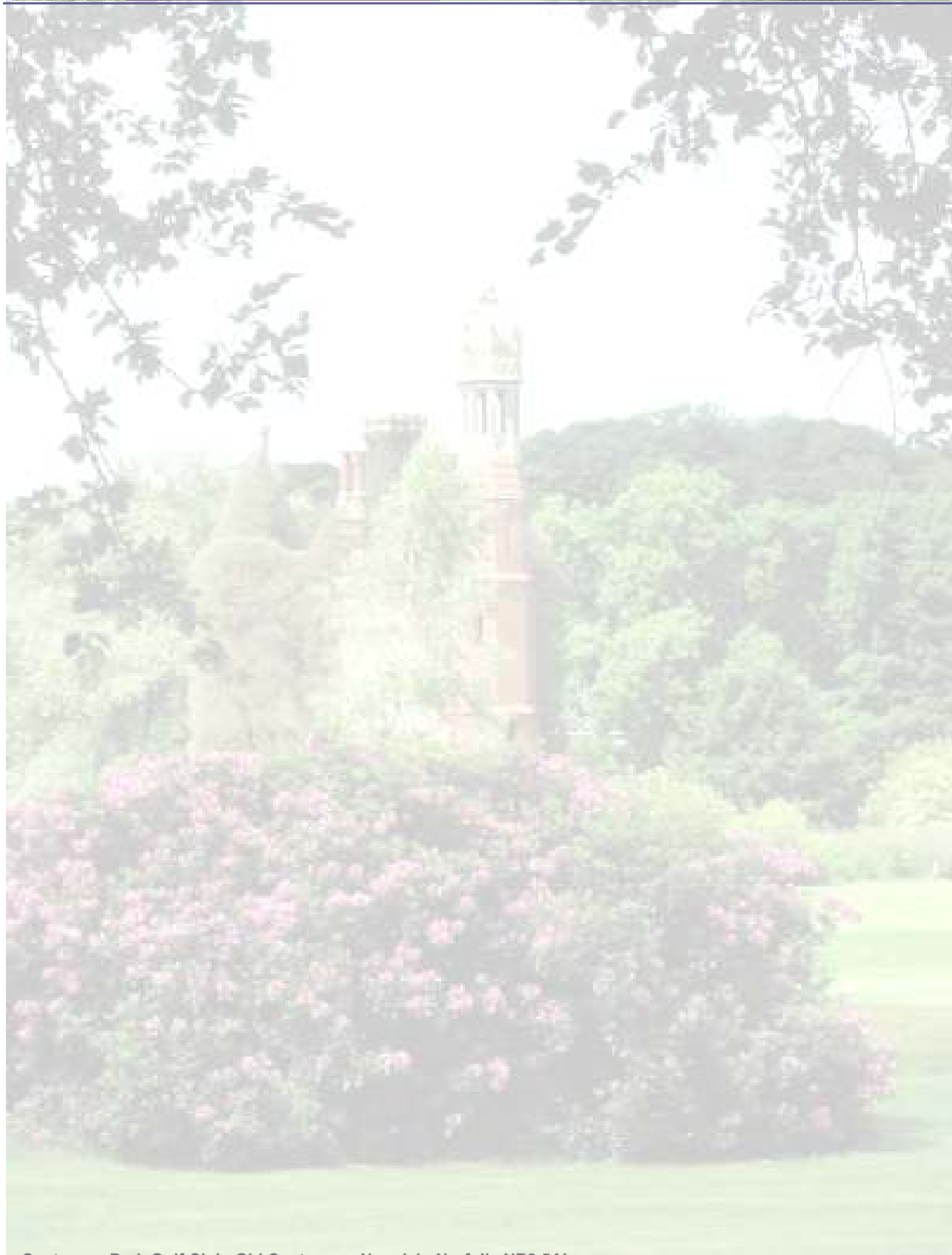
Costessey Park Golf Club, Old Costessey, Norwich, Norfolk, NR8 5AL